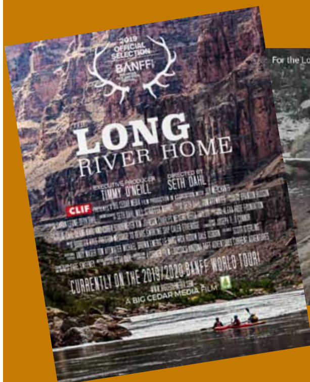
For the Love of Falling – Twisting Fall's Gorge on the Elk River