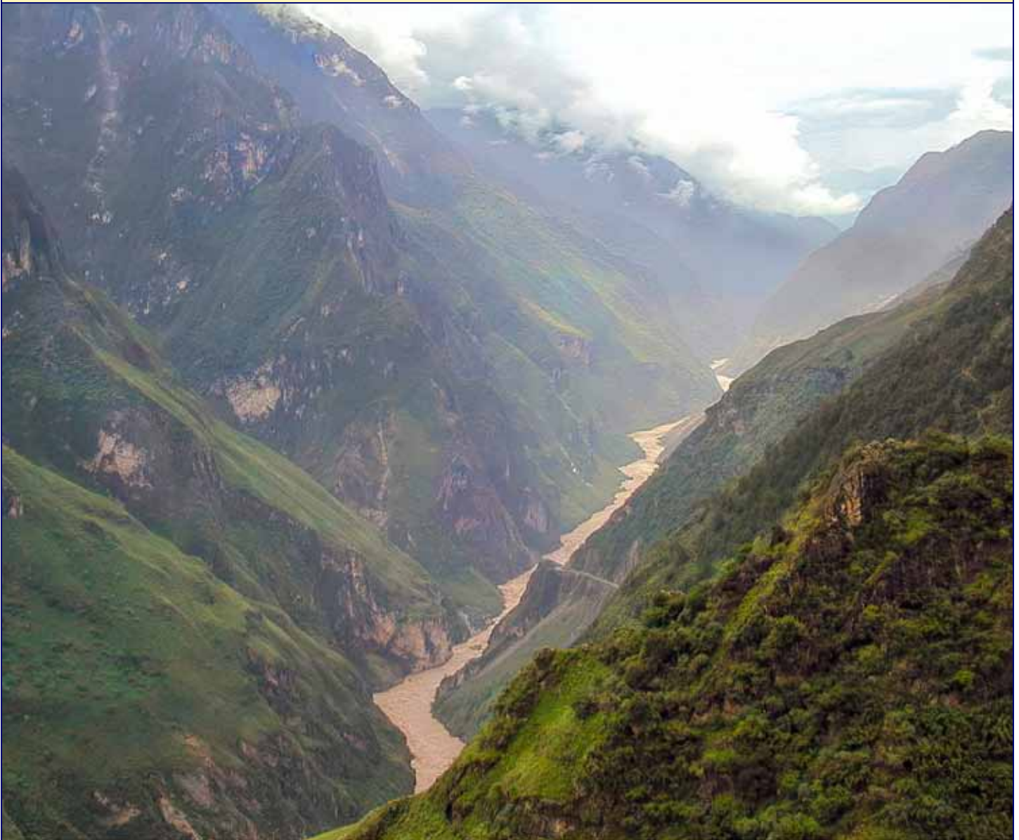
Tiger Leap Gorge with Jade Dragon Snow Mt